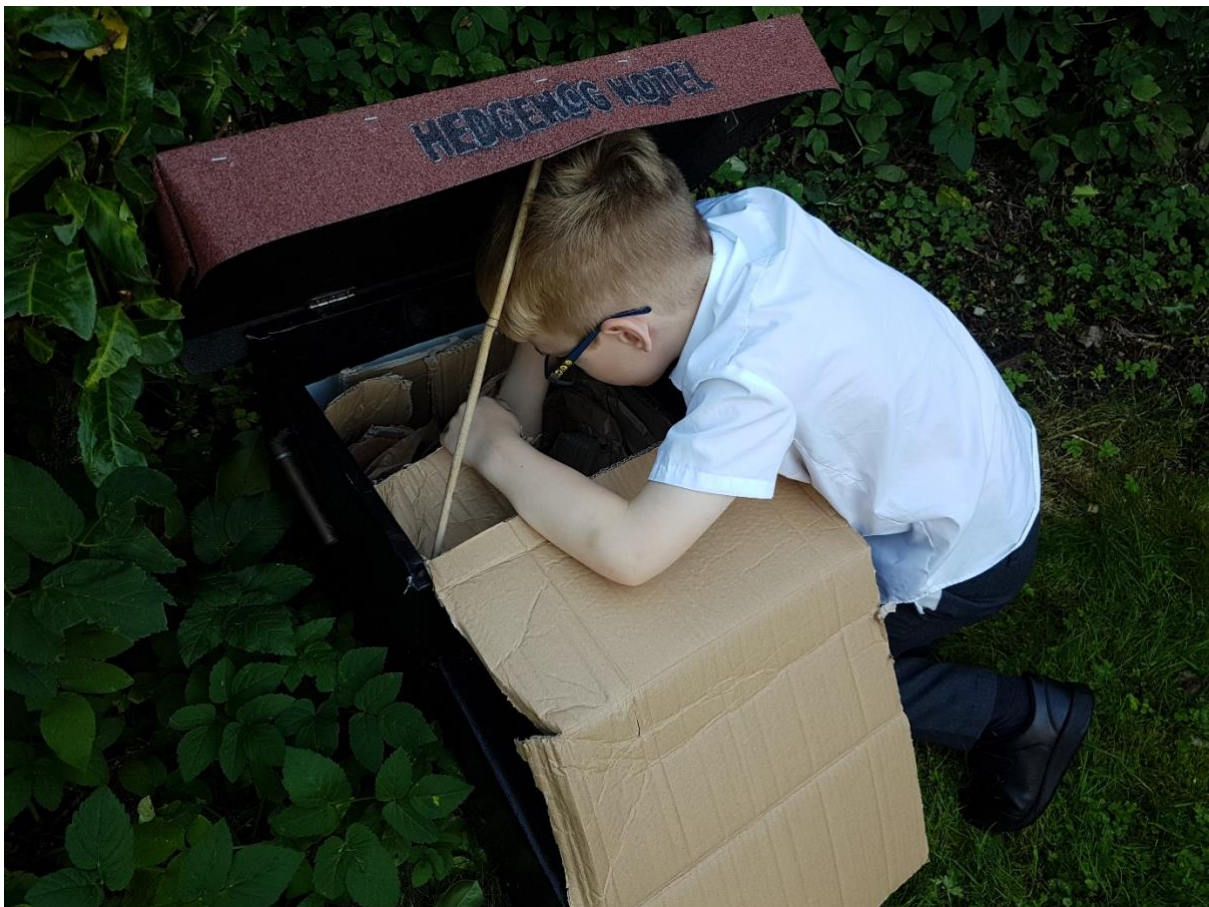
All great fun with a quick count up at the end we both had all fingers intact